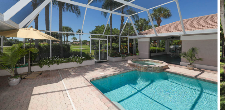
3988 LOSILLIAS DRIVE | $949,000 4 Bedrooms, 3 full baths, 1 half bath, 4,840 square feet