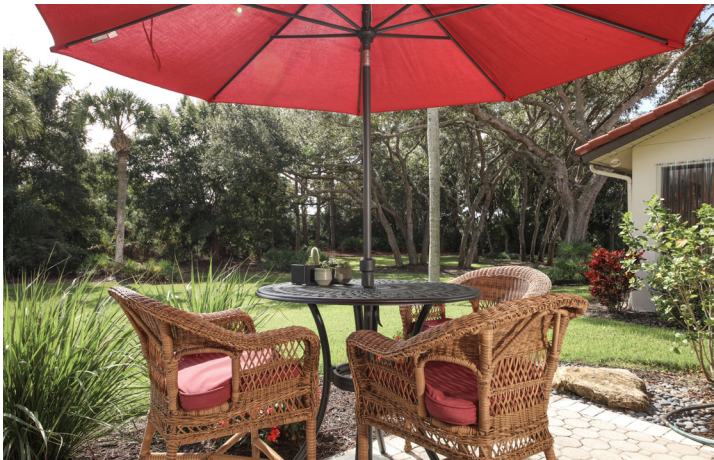
7367 VILLA D ESTE DRIVE | $585,000 3 bedrooms, 3 full baths, 3,046 square feet