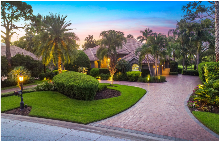
3917 BOCA POINTE | $1,250,000 4 bedrooms, 3.5 baths, 5,081 square feet

The number of condo and villa sales were down through the third quarter compared to last year. Although the average sold price and average sold price per square foot decreased in the third quarter, the average sold price per square foot is still slightly ahead of last year. This is the result of the benchmark sale in the first quarter of an updated free-standing villa with a pool and golf course views selling at $205 per square foot. The price per square foot for condo and villa sales varied from $197.14 to $133.11.