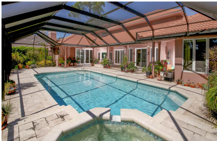
4250 BOCA POINTE DRIVE | $945,000 4 bedrooms, 4.5 baths, 4,372 square feet