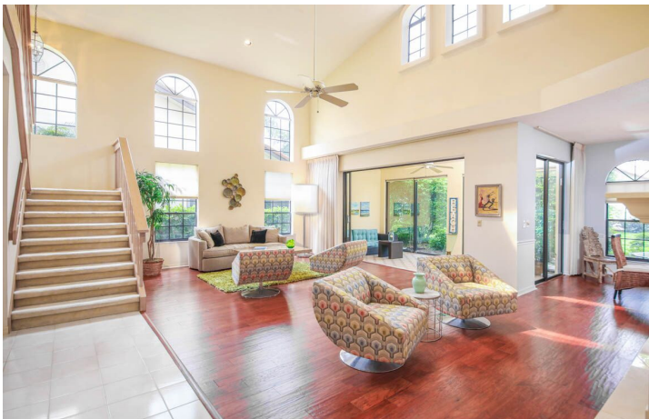
7242 VILLA D ESTE DRIVE | $450,000 3 bedrooms, 3 full baths, 2,887 square feet