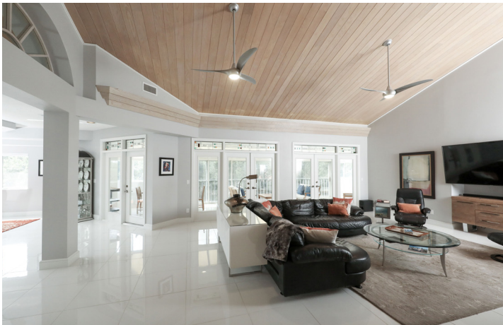
4634 MIRADA WAY #32 | $630,000 3 bedrooms, 3 full baths, 3,199 square feet