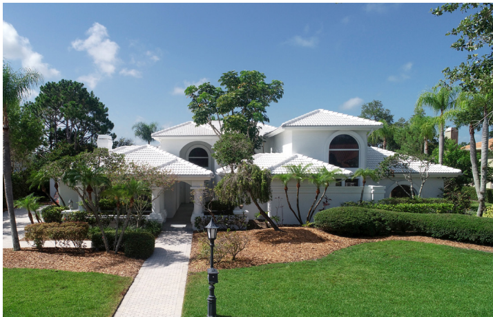
4175 ESCONDITO CIRCLE | $745,000 3 bedrooms, 2.5 baths, 5,051 square feet